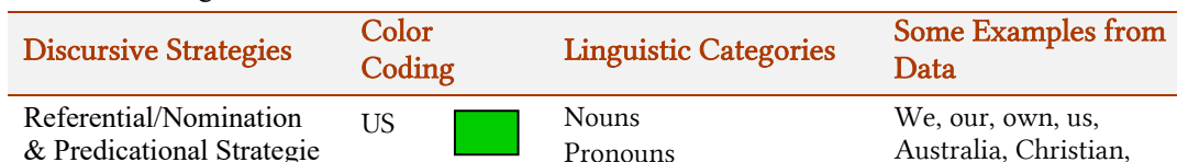
Table 1. Coding for data

The study is based on the paradigm of qualitative research following the methodology of critical discourse analysis. The article uses two different approaches or models as developed by Teun A. Van Dijk, the ideological square and discourse-historical approach (DHA) as practiced by Ruth Wodak and Martin Reisigl. The instrument to analyze the discriminatory, racist and Islamophobic discourses in the speech was developed by conflating the two models. The linguistic categories of Van Dijk were fused within the discursive strategies of Wodak (see table for reference) to extract the implicit and explicit ideologies and infer the latent meanings and interpretations from the discourse. The coding for the data was done with the help of different color keys for convenience (See details of the table in appendix for color keys, underlines, and bold lines) and a detailed interpretation and analysis based on the linguistic devices that are used in the speech is presented in the findings. In the final section of the article the analysis is further interpreted to present the answers to the proposed research questions.